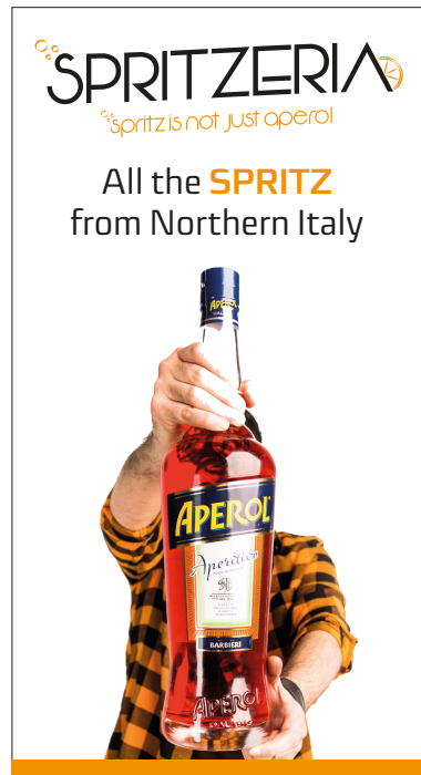
EVERY FRIDAY and SATURDAY

COMBO MEAN Panino + Soup \underline{8} \in Panino + Soup + Coffee \underline{10} \in \underline{6} = 10 \in